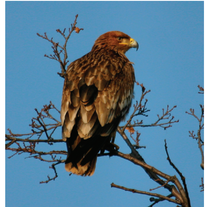
Eastern Imperial Eagle Aquila heliaca.

In 1988, the Martin-Luther University, Halle, Germany, founded MEROS (the "monitoring of European raptors and owls" scheme), with the aim of bringing together and making available the results of the many local and regional raptor and owl monitoring activities that were known to be taking place across Europe. Still extant, this scheme has achieved a great deal (see below). However, it has also identified some of the challenges of encouraging and maintaining such cooperation at a pan-European scale. A workshop on "The Development of a European Raptor Monitoring Network" (Sicily, October 2006)